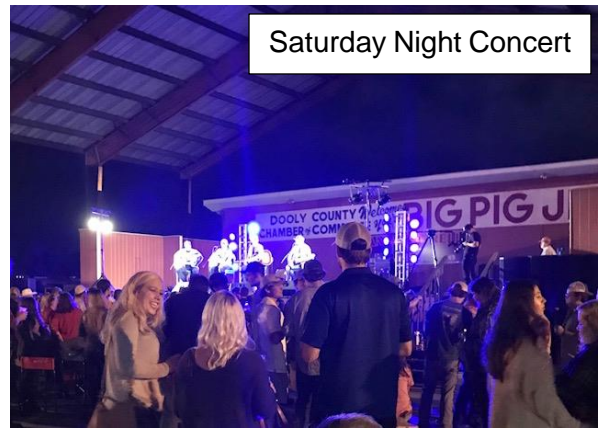
Saturday Night Concert