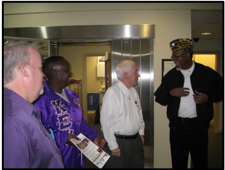
Veterans Tree in Vienna City Hall; Veterans enjoying social hour at City Hall The Ceremony took place in the Dooly County Courthouse Courtroom.