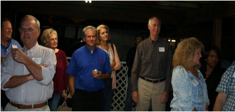
Friday Night Guests at the City of Vienna Booth